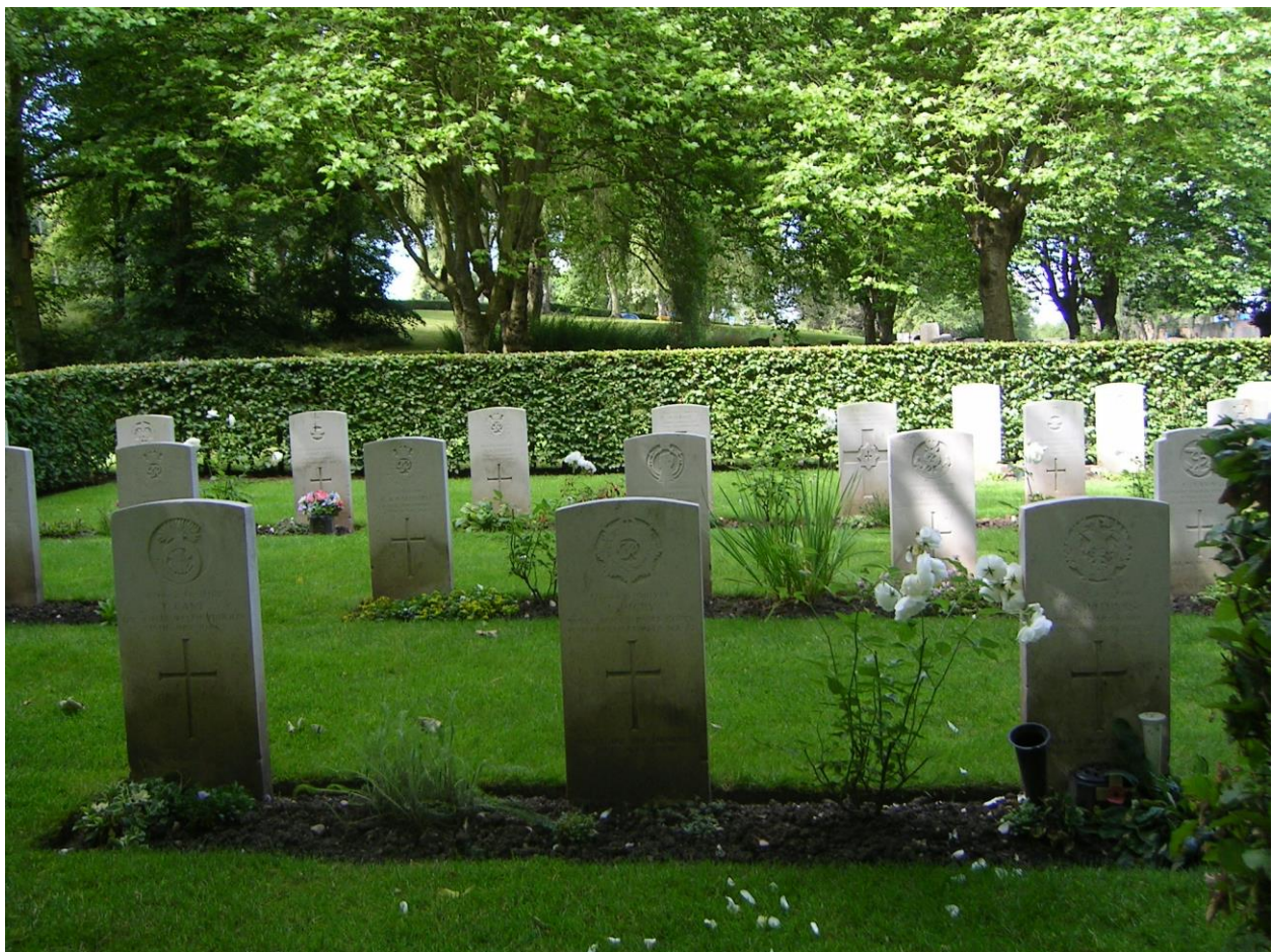
WW2 Garden of Remembrance