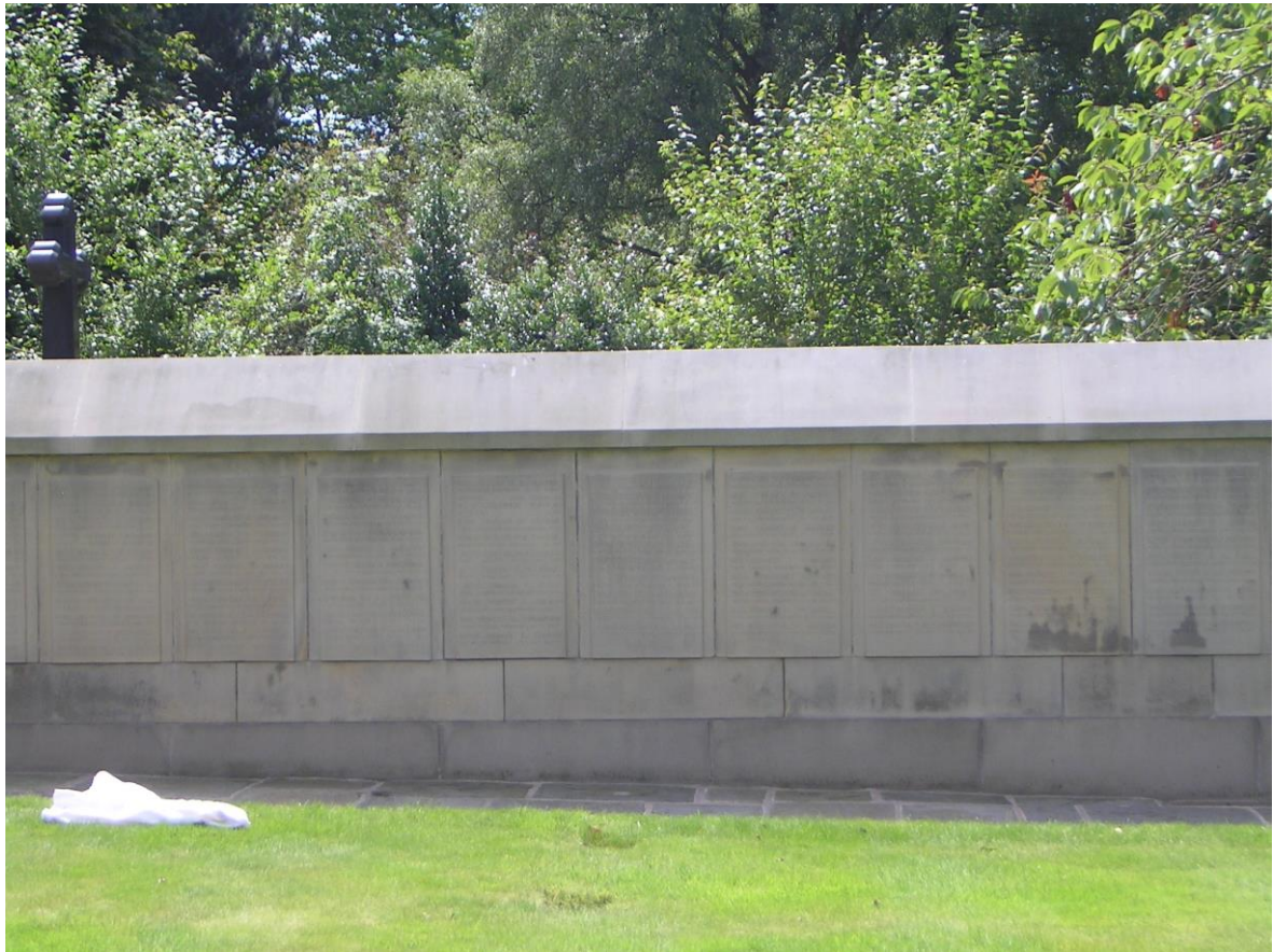
WW1 Screen Wall in Garden of Remembrance